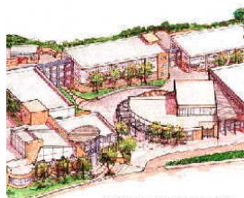
Artist's rendition of new ECHS

El Cerrito High Archiving Project Mission Statement: Support the development of a strong El Cerrito High School alumni body - Collect, preserve and celebrate the history of El Cerrito High School - Develop connections to current students and the El Cerrito community.